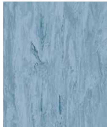
0112 Storm available in SD only

100% REACH compliant Free of formaldehyde, free of heavy metals, free of solvent