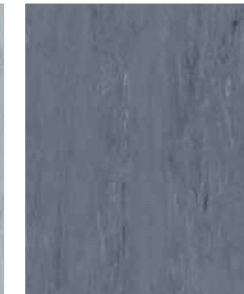
0013 Pewter SD