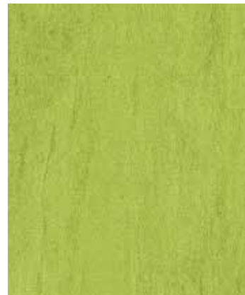
0121 Green Leaf