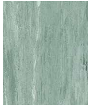
0306 Green available in SD only