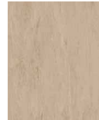
SD 0014 Brown