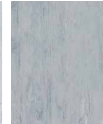
0005 Steel SD